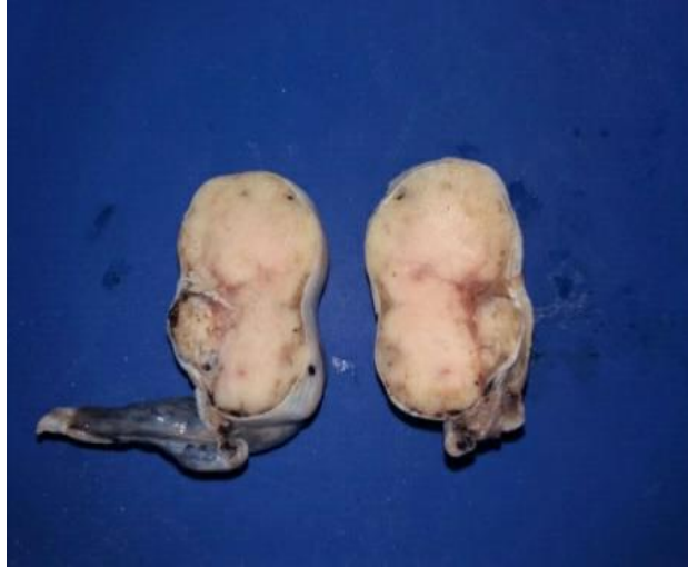
Figure 01: Cross section of the right testicle of the dog (Bob) treated at the Hospital Sylvio Barbosa Cardoso.

The histopathological sections of the testicle exhibited neoplasm reproducing Sertoli cells, by presenting moderate anisocytosis with wide cytoplasm, rounded nuclei of reticular chromatin and evident nucleoli, occupying the seminiferous tubules in almost of its