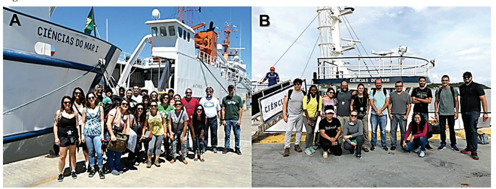
Figure 2 - Students on board

The " Ciências do Mar III " delivered in February 2020 and is docked in Niterói and the " Ciências do Mar IV " docked in November 2020 at the Port of Recife and both now can board students from their regions.